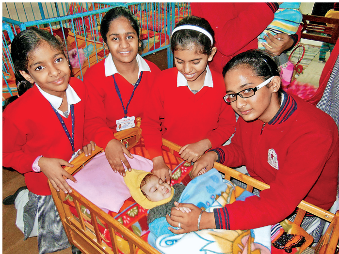
Students of BCM Arya School visiting the orphanage in Ludhiana.