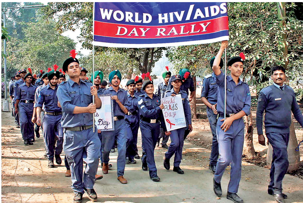
NCC cadets taking out a rally on World AIDS Day in Ludhiana on Monday.