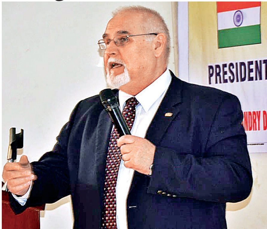
An expert addressing the seminar at GADVASU in Ludhiana on Monday.

Further, the boars are kept at boar station and semen is collected by adopting hygienic measures. The polar Genetics experts provided valuable information regarding transportation, biosecurity and swine health and stressed on importance of washing, cleaning and disinfection of the trucks, trailers for the transportation of live animals. It is important to mention that Polar Genetics is supplying