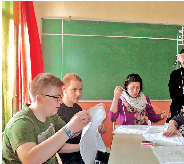
Foreign students during the cultural exchange programme at Ryan School in Ludhiana on Monday.

However, the highlight of the event would be a spectacular performance by the group which will perform dance performances revolving around the dilemmas and difficulties faced by the youth. The sentiment thus portrayed free from the barriers of caste, culture and creed. It speaks of the woe experienced by youth globally. Hence it brought a strong affinity among the youngsters and helps them